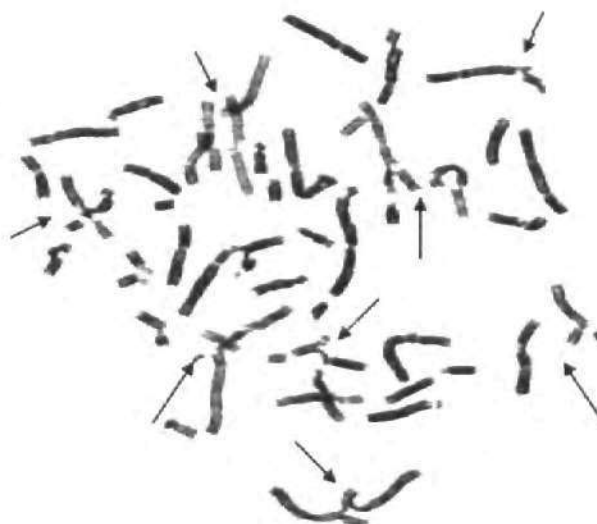
Figure 1. Metaphase spread from a patient with Fanconi anemia, after exposure to mitomycin C (MMC), exhibiting multiple chromosomal breaks and radial formations.

Molecular analysis. Following a positive cytogenetic result, molecular analysis was performed to allow identification of causative mutations. Genomic DNA was extracted from peripheral blood lymphocytes according to the protocol of an automated robotic system (QIAGEN BioROBOT M48; QiaGen, Hilden, Germany). Multiplex ligation-dependent probe amplification (MLPA) was used for the detection of possible FANCA gene deletions. Mutation analysis was performed by Polymerase chain reaction (PCR) amplification followed by Enzymatic cleavage mismatch analysis (ECMA), using the SURVEYOR™ Mutation Detection Kit. FANCA coding exons 1, 7, 25, 26, 28, 32, 33, 34-35, 36, 37, 38, 39, 40-42, where a higher rate of molecular defects has been recorded, were amplified using primers designed by the Authors (Table I). PCR conditions were applied in order to provide the highest accuracy and specificity in the mutation screening assay. They included the activation of polymerase (Hotstar taq/Multiplex) at 95°C for 15 min, followed by 33 cycles of denaturation at 95°C for 1 min, annealing at 55°C for 1min and extension of primers at 72°C for 1min and 72°C for 10 min. Dimethyl sulfoxide (DMSO) was used for exon 1 because of C-G-rich region; annealing of this exon was at 58°C. Samples demonstrating heteroduplex formation were directly