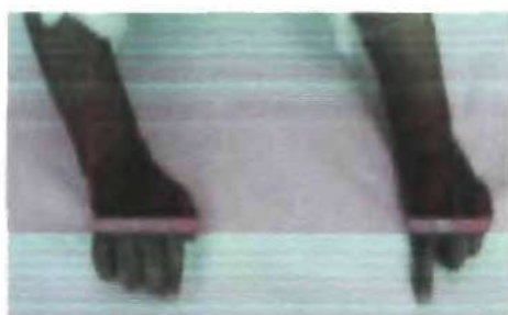
Figure 4. Hypoplasia of the right thumb and aplasia of the left thumb.